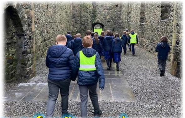
1 Donnard Walking tour of Carlingford